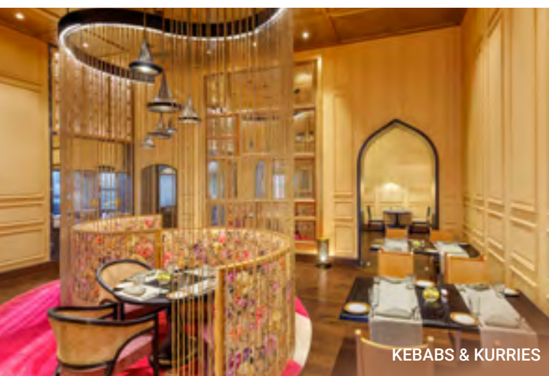
KEBABS & KURRIES