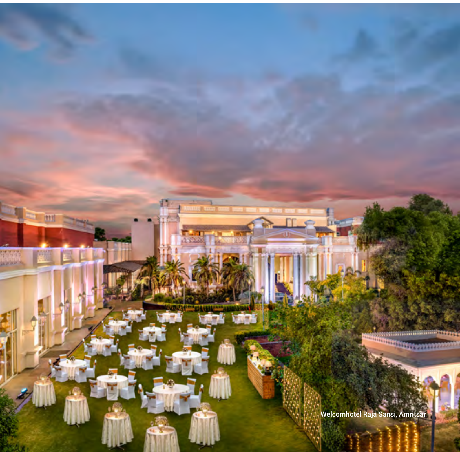
Welcomhotel Raja Sansi, Amritsar