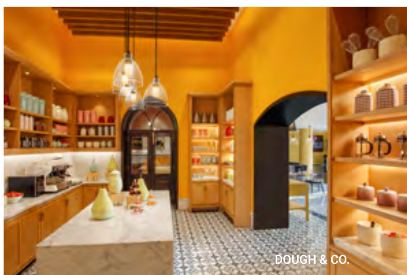
DOUGH & CO.