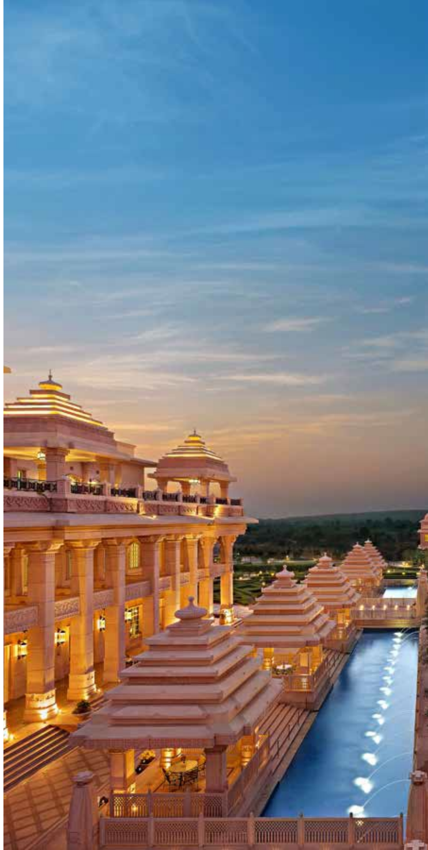
Table D'Hote menu. Experience unhurried luxury at its best as you watch the sun set over the horizon exclusively at ITC Grand Bharat.

Share a romantic candlelit dinner by the Ghats of Yamuna in your very own private gazebo. Celebrate memorable moments of togetherness with a four course