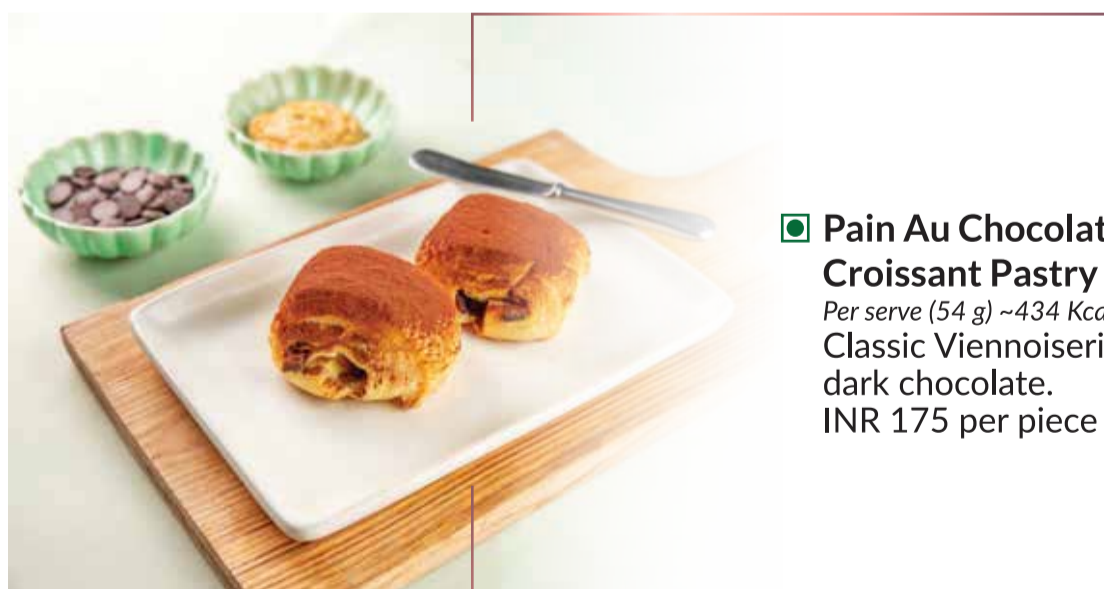
🇮🇳 Pain Au Chocolat - Chocolate and Croissant Pastry 🍞 🌾 🍫 Per serve (54 g) ~434 Kcal Classic Viennoiserie with a filling of dark chocolate. INR 175 per piece