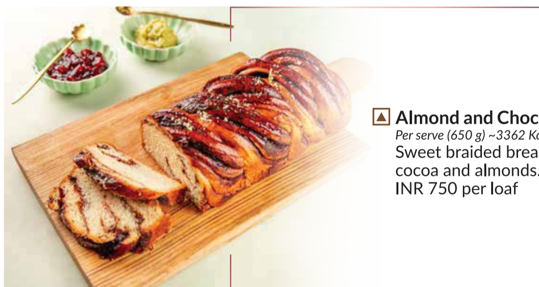
▲ Almond and Chocolate Bread 🥚 🍞 🌾 🥜 🍫 Per serve (650 g) ~3362 Kcal Sweet braided bread with toasted cocoa and almonds. INR 750 per loaf