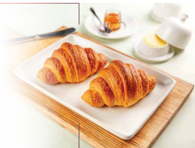
🍞 🌾 Classic Butter Croissant 🇮🇳 Per serve (54 g) ~324 Kcal The all-time favourite buttery and flaky Viennoiserie. INR 150 per piece